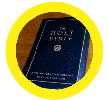
ESV CE Bible Approved by the CCBI