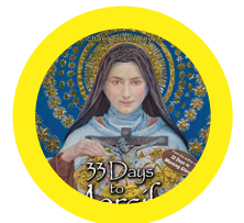
33 days to Merciful Love- Self Retreat