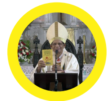
Synod Handbook - Vademecum