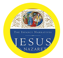
Jesus of Nazareth the Infancy Narratives - Pope Benedict XVI

Cut the cube along the solid red line and fold along dotted lines. Roll the dice during advent and do the activity which comes to you. The idea is to do this activity as a family (or as a community if you are consecrated)